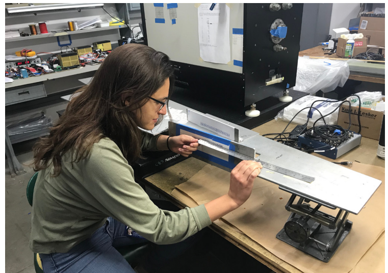
SULI student checks the spatial calibration of a charge exchange recombination spectroscopy system, as part of research into 3-D effects on plasma equilibrium

For more FAQs visit: https://science.osti.gov/wdts/suli & https://science.osti.gov/wdts/cci