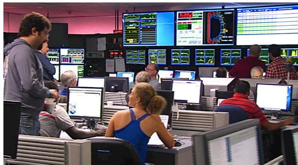
Students working in the DIII-D National Fusion Facility control room during experiments to advance fusion energy science

SULI/CCI offers selected applicants an opportunity to perform research under the guidance of laboratory staff scientists and engineers with sponsorship by the DOE.